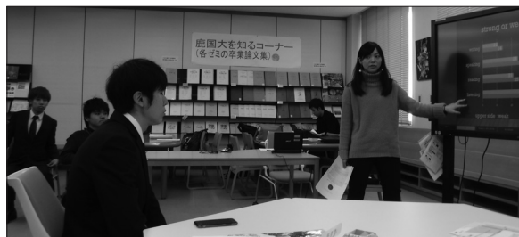
Figure 2. Capstone presentation with peers and TA.

Toward the end of the capstone thesis writing process, the author should be encouraged to share their findings with seminar classmates during a group presentation. A final presentation to the whole seminar would encourage students in lower grades to possibly follow in the presenter's footsteps.