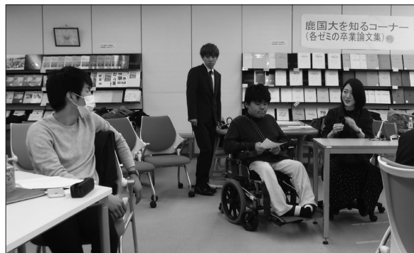
Figure 1. Capstone workshop with SAs and TAs.

Large universities sometimes open writing centers in which students can seek assistance from SA's and TA's throughout the school year.