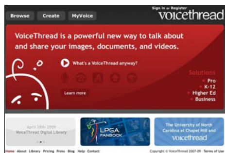
Figure 1. Voicethread main interface

a sense of community around their experiences. We decided that a good way to help students reflect on their experiences would be to encourage them to share their feelings and thoughts with peers, the wider university community and family. The sharing process would result in them producing something concrete and would also serve as a good way to reintegrate them into their normal studies; the transition from a study abroad period and returning home can be difficult. Voicethread allows us to do all these things.