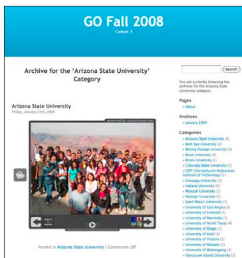
Figure 2. Completed project gathering embedded slideshows

On return to Japan: Students submit their slideshows approximately 3 weeks after their return to Japan. During this time, students have access to the university's computer facilities and are able to seek assistance from teachers in order to complete the task. Finally, students email the embed code to their teacher so that the slideshow can be made public on a website.