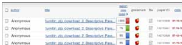
Figure 1. Student submission page displaying the similarity report

tions, authors, or publications to view private documents.