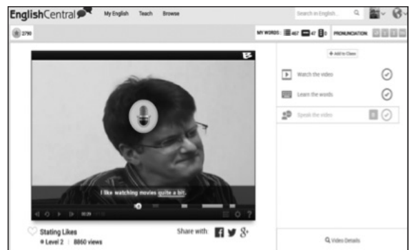
Figure 1. Screenshot of English Central pronunciation practice section.

An additional useful feature of EC is that students can practice their pronunciation (see Figure 1). EC is one of only a few online programs that provides pronunciation feedback. If there are some specific sounds that learners have difficulty pronouncing, they can access courses that focus on pronunciation in order to overcome these difficulties. From the survey, a lot of students indicated that the pronunciation practice on EC was a good chance to review their own pronunciation as they had had limited opportunities to practice pronunciation in junior high or high school. The adoption of EC gave students chances to review phonetic rules that they learned in the IPE course. This benefited the students because their pronunciation was tested throughout the course. However, one minor technical drawback of EC that some students mentioned on the survey was that the pronunciation-check function was not always reliable because some students were not quite sure what the criteria for the pronunciation judgment was based on.