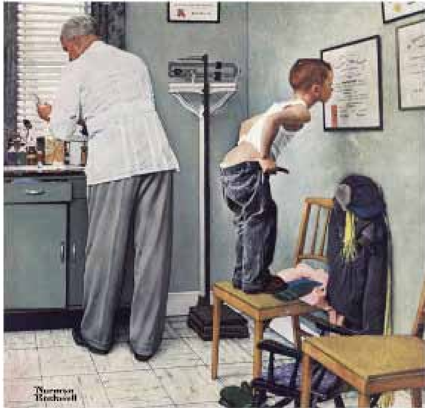
Norman Rockwell, Before the Exam