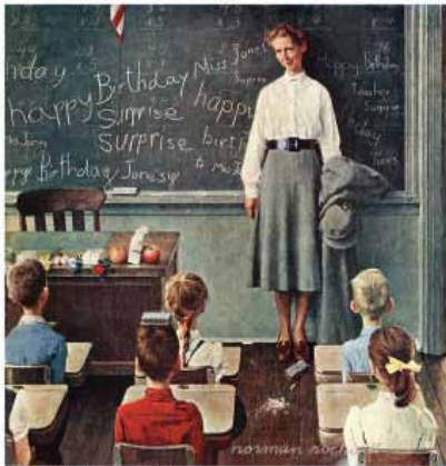
Norman Rockwell, Happy Birthday Miss Jones March 21, 1948

Look at the picture above. How many questions can you make?