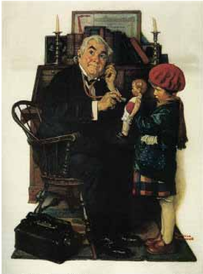
Norman Rockwell, Doctor and the Doll