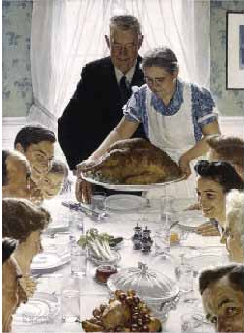
Norman Rockwell, Freedom from Want