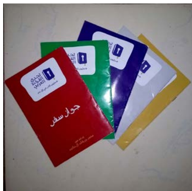
Figure 1. Student's Reading Passports

To take part in ARCI students should register their names with the school librarian who is a member of ARCI committee at school level and receive reading passports. There are five passports for each participant. They come in different colors. They are as follows: red, green, blue, silver and golden. The inside pages of passports are similar and the different colors just identify the amount and order of readings. The red passport contains the first ten books and stories which were read by the student while the golden passport includes the final ten books and stories.