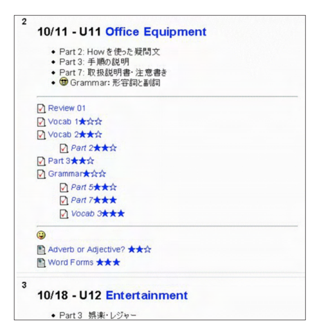
Figure 1. Choosing activities

Increasing students' abilities to communicate through computers and providing opportunities to use English outside the classroom for building personal relationships can be accomplished with a CMS. For example, Moodle offers instant