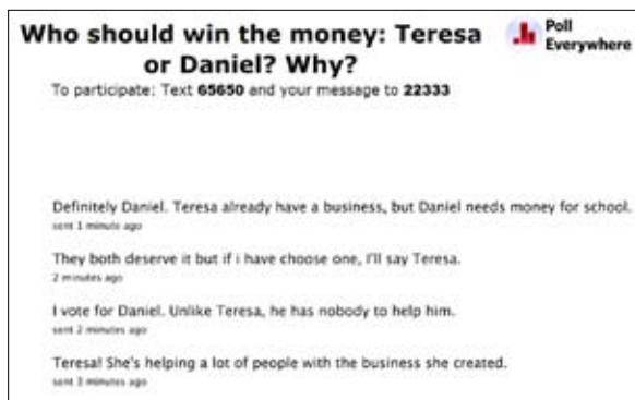
Figure 4. Poll type: Free text poll

Using a laptop, teachers can project learners' replies in the front of the room. As mentioned, results update automatically as responses are received. A poll in this activity might look something like this: