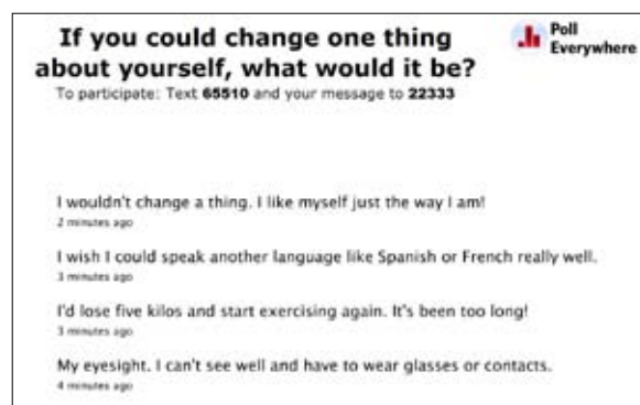
Figure 2. Poll type: Free text poll (responses cycle as they come in)