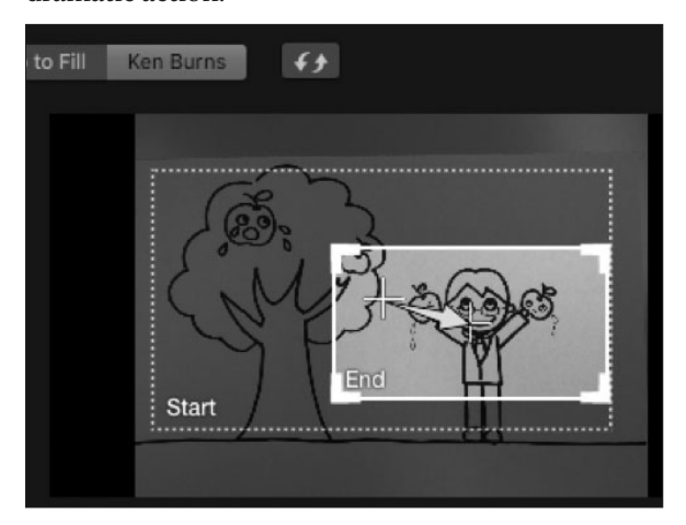
Figure 2. Setting up the Ken Burns Effect, Screenshot of Apple iMovie 10

wide view from where we can see both runners and then ending at a close up of the second runner's face. The result creates a feeling of motion and dramatic action.