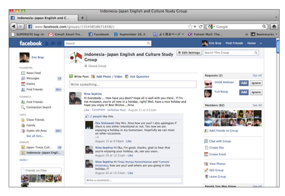
Figure 1. Indonesia-Japan English and culture study Facebook Group page

explain the privacy settings in Facebook, especially to new Japanese users used to Mixi where real names and photos are not used. For their profile photo, some students chose to use avatars such as cartoon characters, rather than their faces. Students were reminded that the group was a private group and that it was not necessary to friend anyone in the group. In addition, class discussions were held concerning appropriate topic choice and language use in posts.