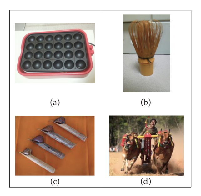
Figure 2. Student photographs of Mystery Cultural Objects/Activities.

Step 3. Students then post the photo on the Facebook group page and ask students in the partner country to guess what the object is used for, or in the case of an activity, ask what people are doing and why. Students from the other culture write posts making guesses about the use or purpose of the object/activity.