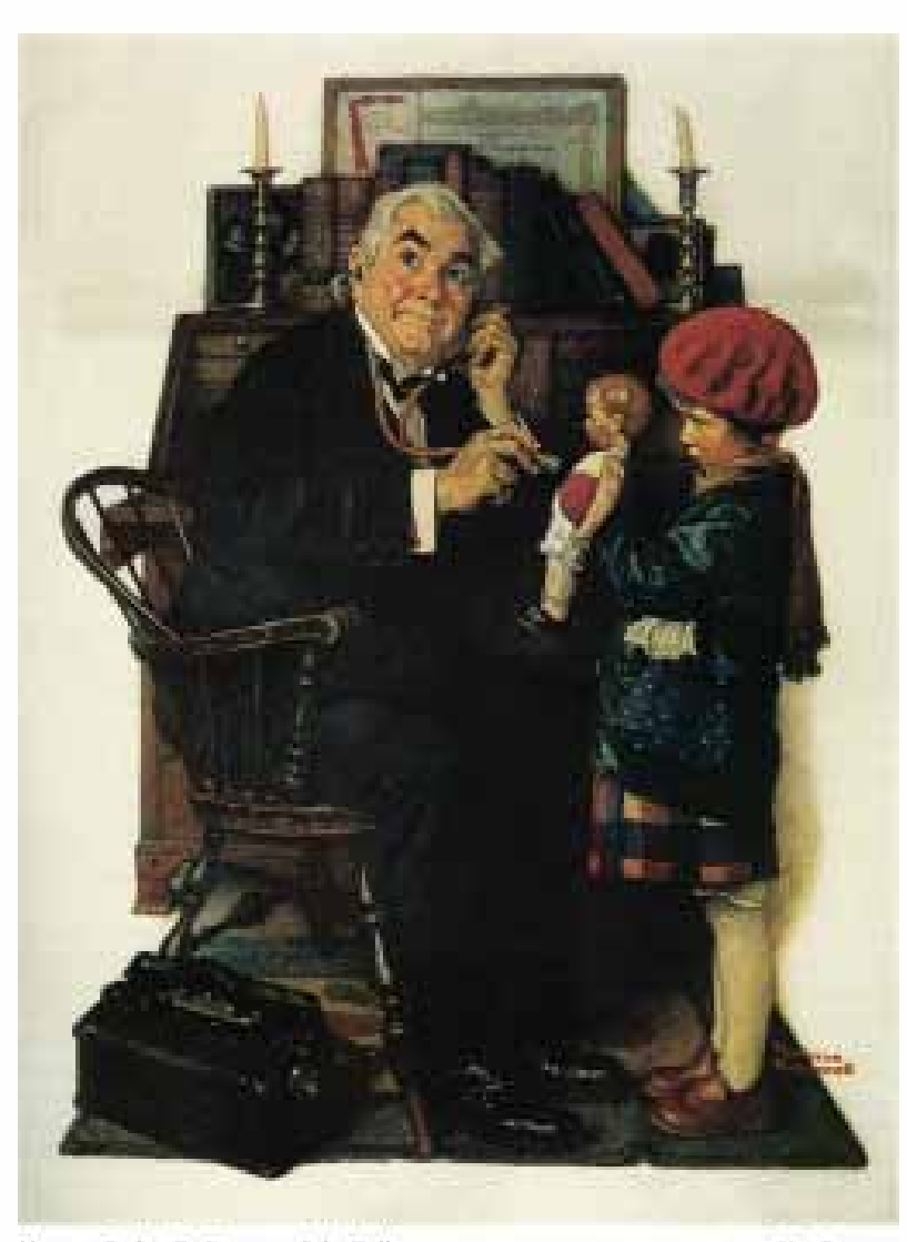
Norman Rockwell, Discovered the Dull