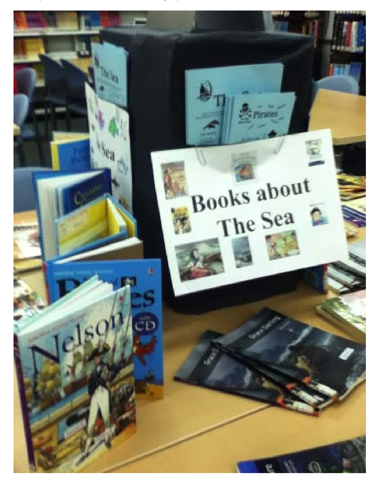
Appendix A. Photograph of a library display of books about "The Sea" and "Pirates" with small posters and annotated bibliographies.